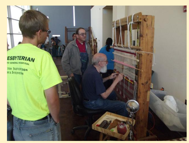
Weaving Demonstration – A skill that takes years of dedicated work to perfect