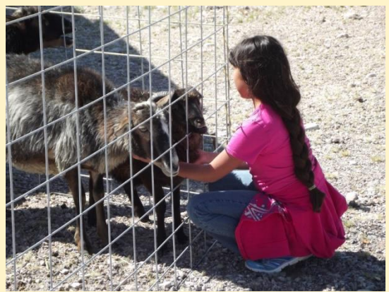
Churro sheep, first brought to New Mexico by Spanish settlers traveling on El Camino Real