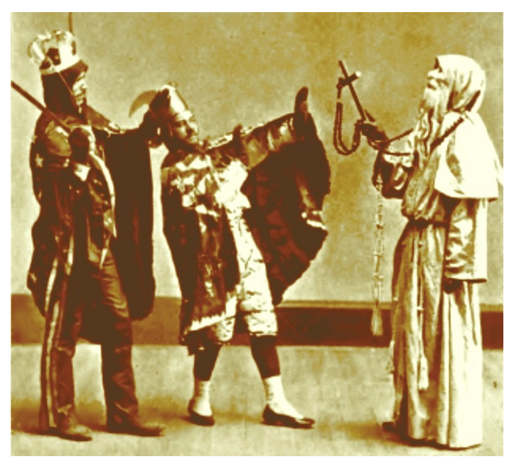
Two devils confronting the Hermit.