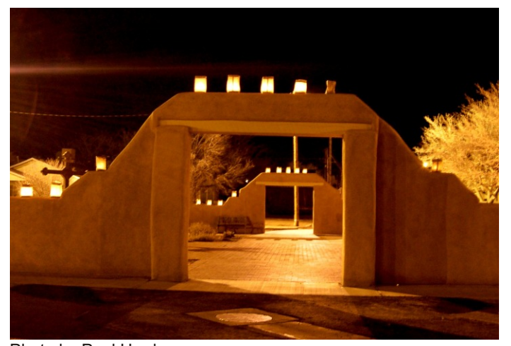
Traditional luminarias lighting the way to the San Miguel church in Socorro.