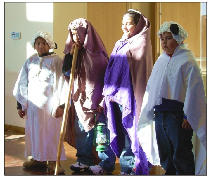
During Las Posadas, Joseph, Mary, and the shepherds are usually portrayed by children.

Las Posadas processions goes back to the conquest of Mexico by the Spaniards in the early 1500s. Some