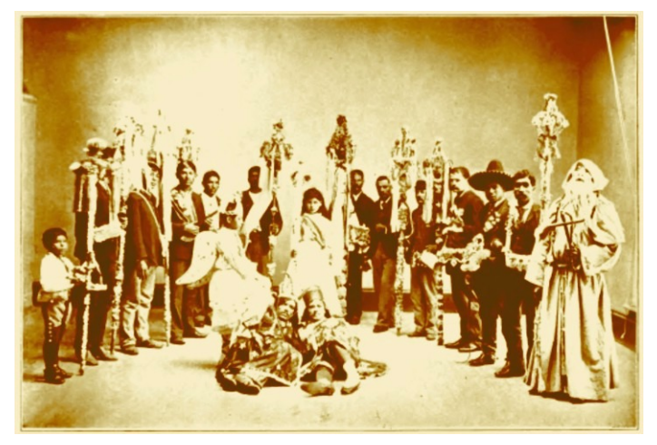
The performers of Las Pastorela, 1893. The performance was at either San Antonio, Texas or San Gabriel, New Mexico.