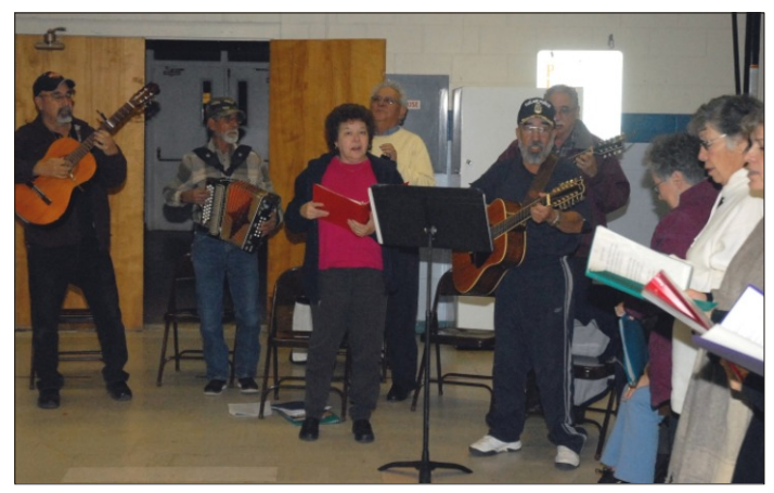
Gran Pastorela de Belen rehearsing for the numerous presentations they perform throughout New Mexico during the Christmas season.

The old, traditional Los Pastores might have been lost had it not been for the Chavez families of Las Nutrias in