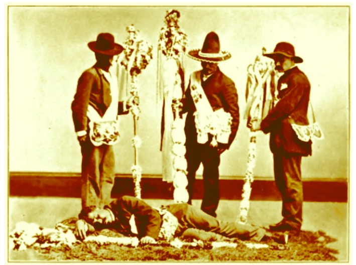
Three shepherds trying to wake Bartolo.