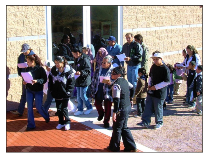
La Associacion de la Guadalupana de Socorro sings Las Posadas for visitors at El Camino Real International Heritage Center – going door-to-door and asking for a place to stay for the Virgin Mary.

was grouped. Above, a clothes-line was stretched the length of the hall. From it was suspended a smoky kerosene lantern, the Star of Bethlehem, which the stage manager jerked along just in advance of the shepherds by means of a long wire.