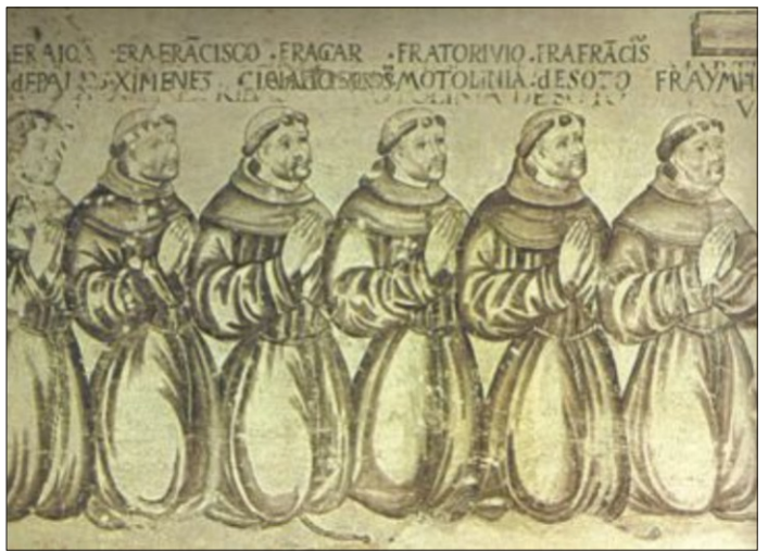
Order of Franciscans A mural at the monastery in Puebla, Mexico depicts the 1500s Franciscans in the New World. The Franciscans were the principal missionary order in New Spain.